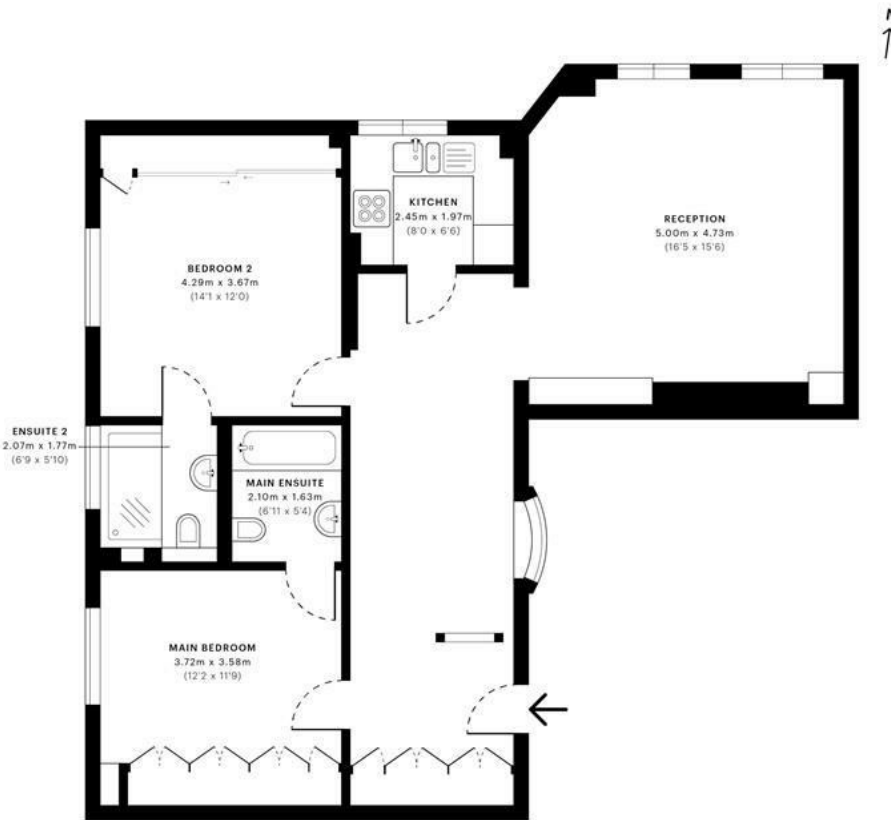
— Fourth Floor

GROSS INTERNAL AREA (GIA) The footprint of the property 87.96 sqm / 946.79 sqft